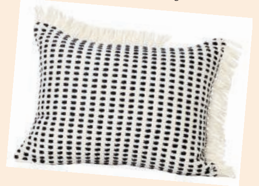
▲ Way cushion by Ferm Living £85 Suitable for both indoor and outdoor use, this durable cushion is made from 55 recycled plastic bottles. A matching rug is available. heals.com

▲ Lacquer tray by Matilda Goad £450 Made from colourful stained wood with a high-gloss finish, and complete with Goad's signature scallop edging. matildagoad.com