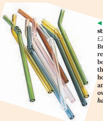
■Sip drinking straws by Hay £25, set of six Brightly coloured reusable straws in borosilicate glass, these can be used in hot or cold drinks, and come with their own cleaning brush. hauslondon.com