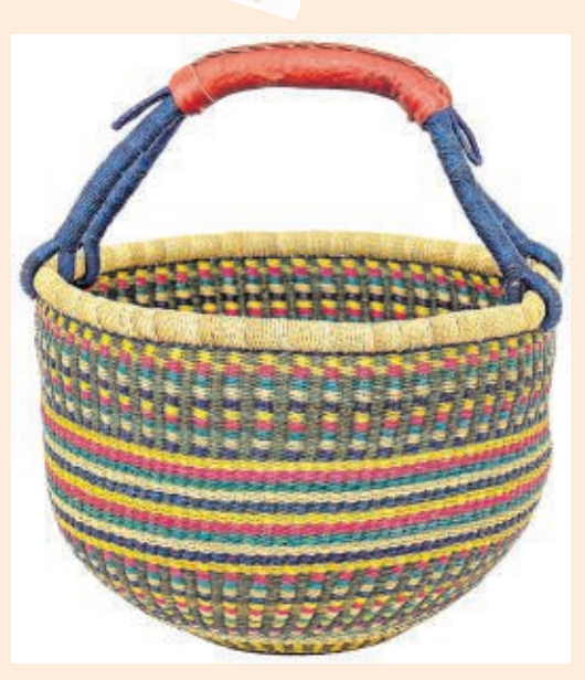
▲ Bolga picnic basket from Afroart SKr450 (£39) Woven in the Bolgatanga area of northern Ghana, these baskets are made